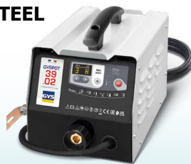
EASYLINER 39.02 - ref. 053618