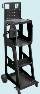
Spot 1000 trolley ref. 053540