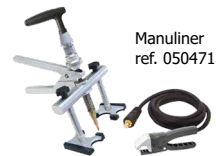
Manuliner ref. 050471