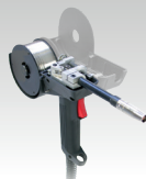
Torch Spool Gun