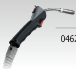
Torch Push Pull