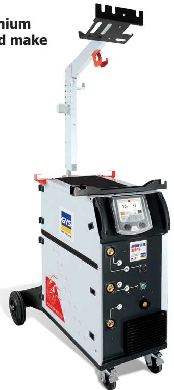
Supplied without accessories (over hanging torch support included)